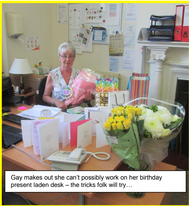
Gay makes out she can't possibly work on her birthday present laden desk – the tricks folk will try...